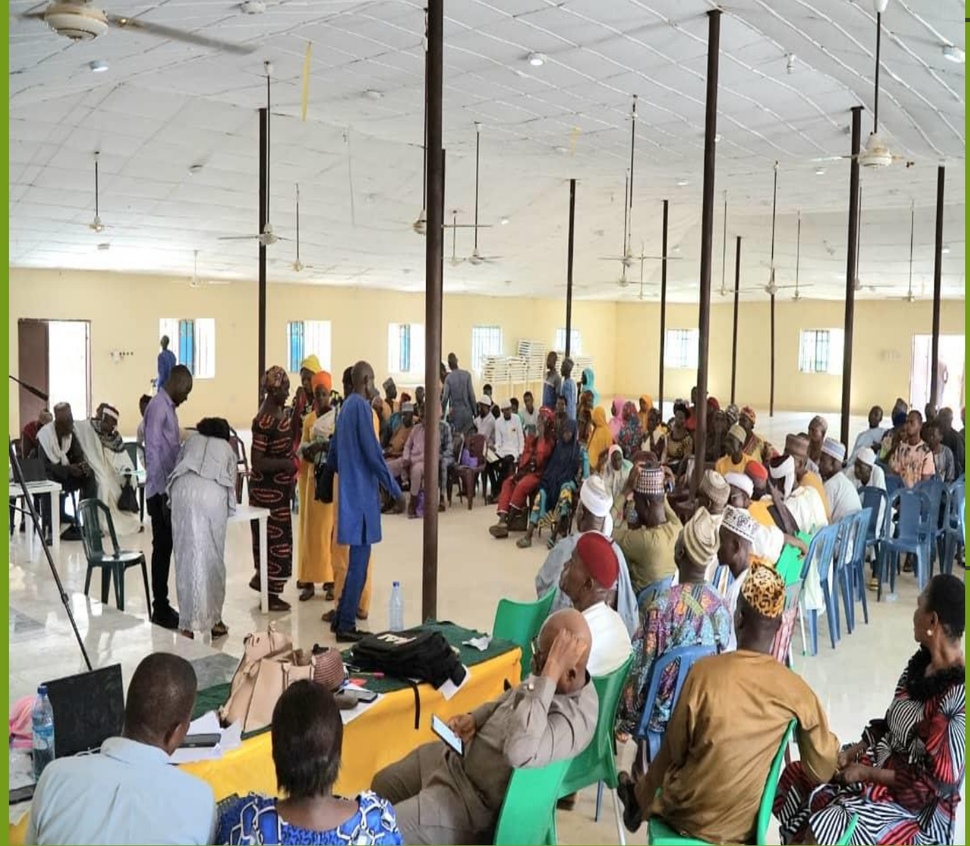
TRAINING OF SITE IMPLEMENTATION COMMITTEE IN FCT.

FCT organized training for the Site Implementation Committee this is to strengthen the community involvement in the successful implementation of ACREsAL project at community level, the training was to give much understanding of the roles of the committee in ensuring peace in their communities, how to monitor project at community level and keeping of records among the CIGs